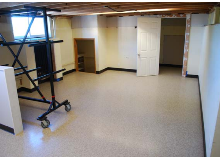
Could this really be the ‘Stinky Room’??