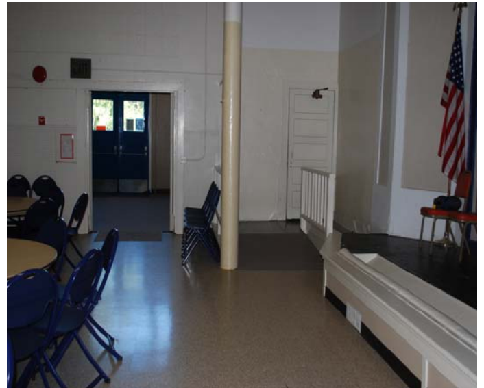
And no steps to the restrooms (above, or the kitchen/cafeteria (below), either.