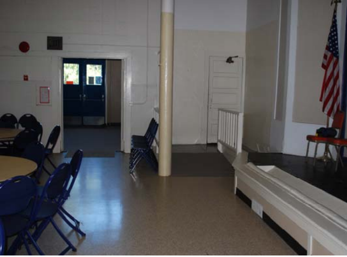
View of current entry