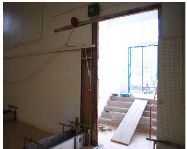
Previous entry (during construction)

remodeling of the auditorium, by the council members. Over the next three weeks over a thousand man-hours were put in by members of the council, in raising the floor of the auditorium approximately three feet. This removed the steps at the entrance, to the rest rooms, to the back hallway and to the cafeteria. For years we have been dodging potential lawsuits from a serious fall by the many men and women, a lot of whom are elderly, that do so much work, in serving breakfast, luncheons, coffee-an's, dinners, receptions, and Bingo's.