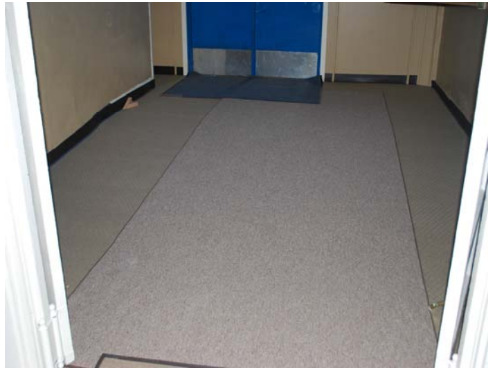
The new entryway: “Look Ma, no steps”