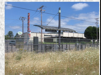
Proposed Site in Springfield, OR

Please remember that October is the Right to Life Month for the Catholic Church in America and many activities are occurring in the area. In Portland there will be a special vigil to start 40 Days for Life. Please come to Life Change Christian Center very near Emmanuel Hospital at 3635 N. Williams Ave, Portland Oregon, on Saturday, September 24, 2011 from 1 to 3 PM. We are urging all Councils to be involved with 40 Days for Life by participating in vigils and helping vigil leaders sign up volunteers. Please visit 40DaysForLife.com/location and scroll down to Oregon to find the location in your area. Knights are also asked to participate in Life Chains in your area. Please visit lifechain.net and scroll down on left side to Oregon. Please note that Portland's life chain is on October 30, 2011 and not on October 2, 2011.